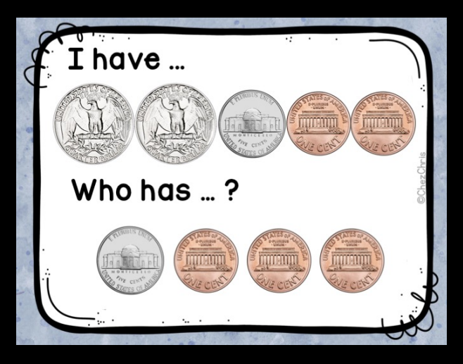
no half dollar or dollar coins