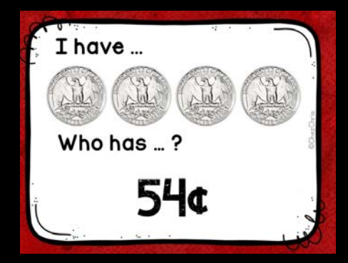
sum written at the bottom no half dollar or dollar coins