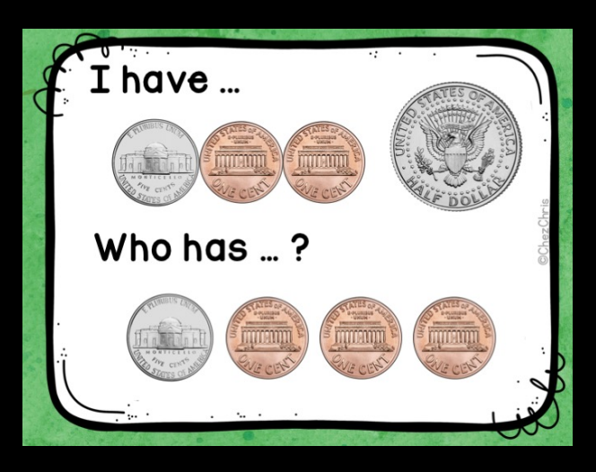
with half dollar and dollar coins