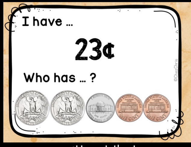
sum written at the top no half dollar or dollar coins