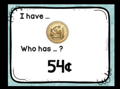
sum written at the bottom with half dollar and dollar coins