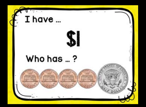
with half dollar and dollar coins